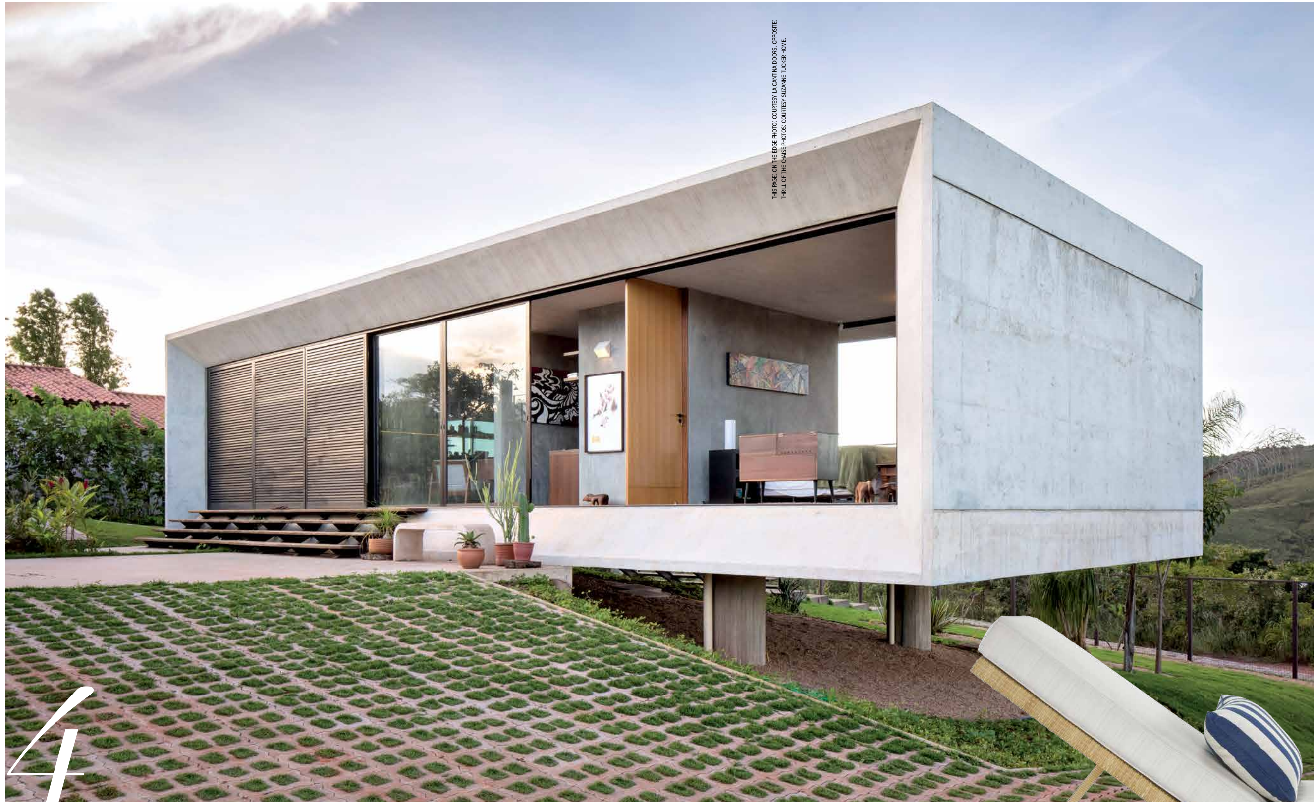
THIS PAGE, ON THE EDGE PHOTO, COURTESY LA CANTINA DOORS. OPPOSITE PAGE, THRILL OF THE CHAIRS PHOTO, COURTESY SUZANNE TUCKER HOME.