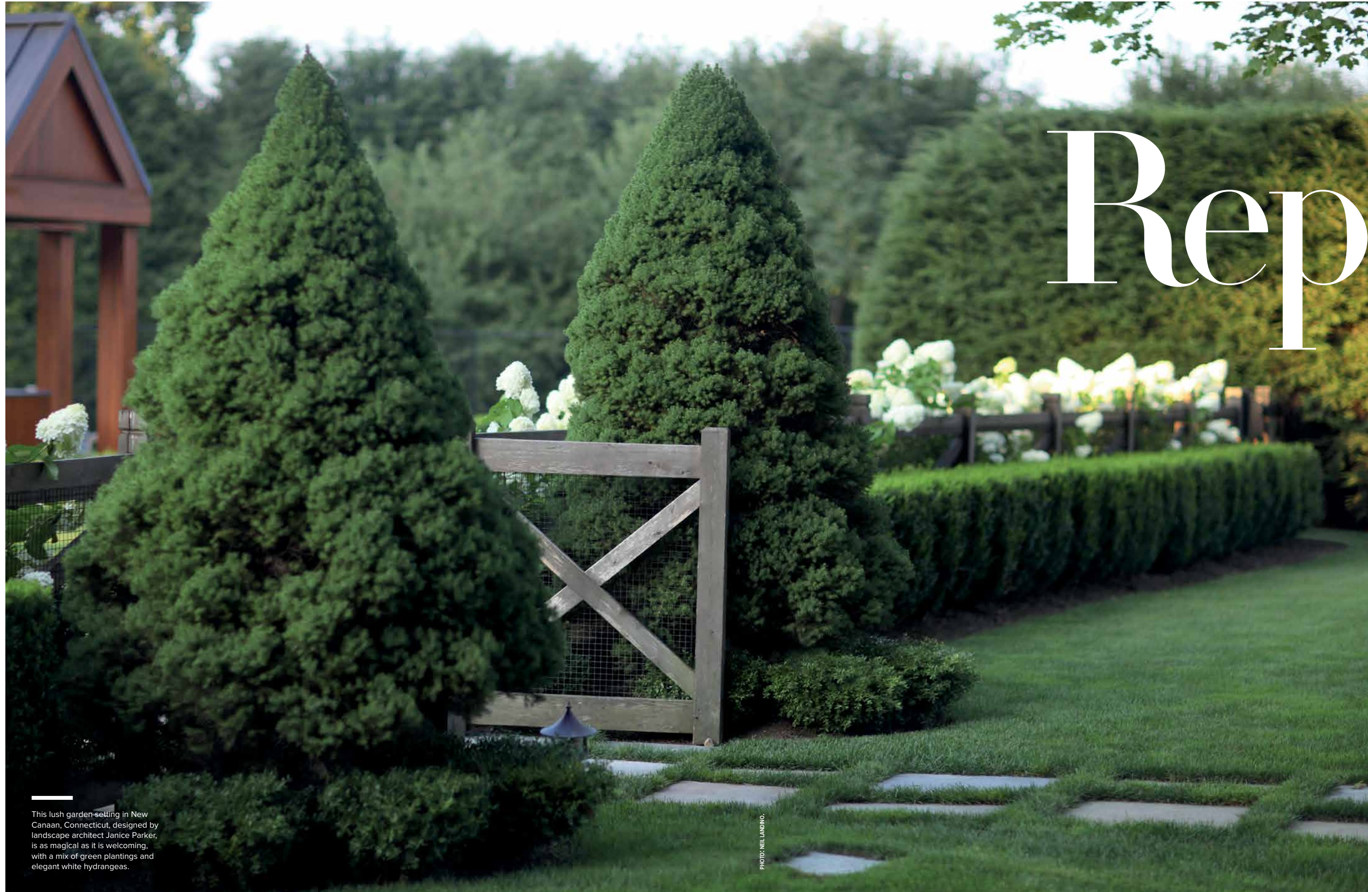
This lush garden setting in New Canaan, Connecticut, designed by landscape architect Janice Parker, is as magical as it is welcoming, with a mix of green plantings and elegant white hydrangeas.