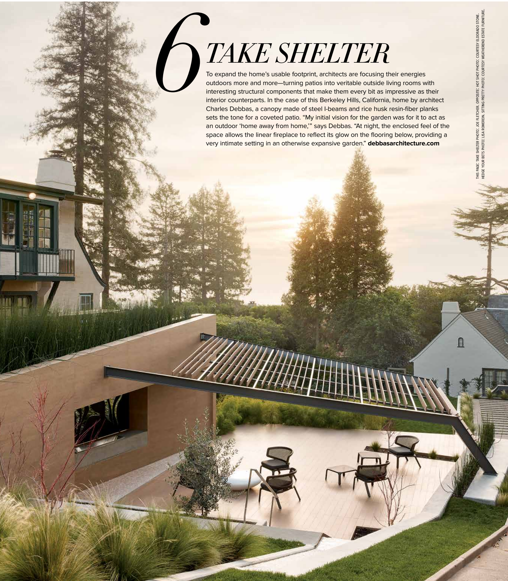
THIS PAGE: TAKE SHELTER PHOTO: JOE FLETCHER, OPPOSITE: HOT SPOT PHOTO: COURTESY, ELDERADO STONE, HEDGE YOUR BETS PHOTO: LISA ROMERIN, SITTING PRETTY PHOTO: COURTESY WEATHEREND ESTATE FURNITURE.

To expand the home's usable footprint, architects are focusing their energies outdoors more and more—turning patios into veritable outside living rooms with interesting structural components that make them every bit as impressive as their interior counterparts. In the case of this Berkeley Hills, California, home by architect Charles Debbas, a canopy made of steel I-beams and rice husk resin-fiber planks sets the tone for a coveted patio. "My initial vision for the garden was for it to act as an outdoor 'home away from home,'" says Debbas. "At night, the enclosed feel of the space allows the linear fireplace to reflect its glow on the flooring below, providing a very intimate setting in an otherwise expansive garden." debbasarchitecture.com