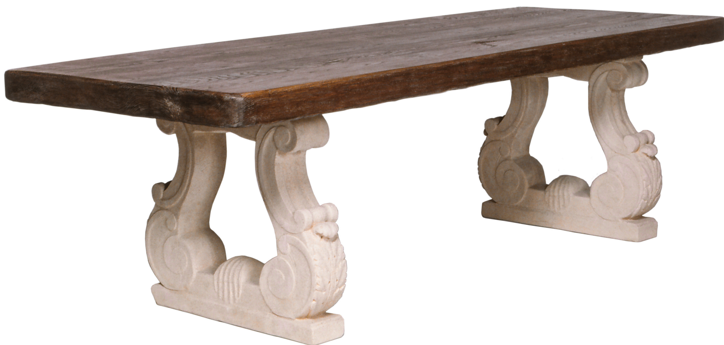
MTD-8000/26 Lyre Base Pair 28"W X 26"H or 28 1/4" X 5" Thick