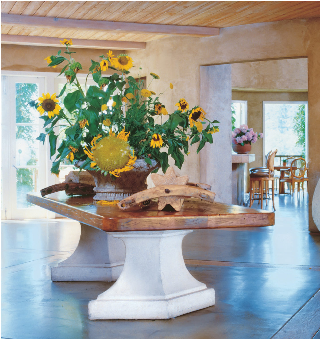
MTD-2037 Diamond Table Base 38"W X 19"D X 26"H or 28 1/4"