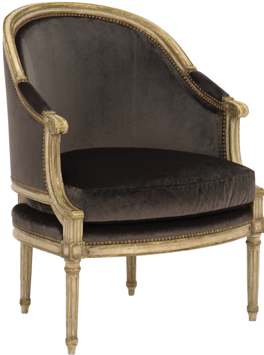
MTD-0901 Bergere 28"W X 30"D X 37 1/2"H Arm Height 29 1/4" at front